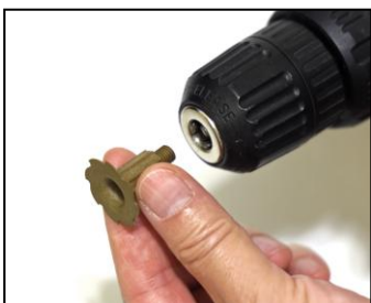
Attaching CSR to drill chuck interface