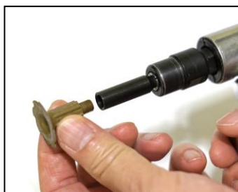
Attaching CSR with straight shank adapter