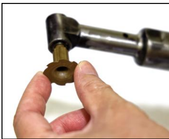
Attaching CSR to 1/4"-28 UNF interface

BA 4100 Series CSR can be used on rotary tools with 1/4"-28 UNF, 1/4" collet, and drill chuck interfaces. Screw in or attach/lock into rotary tool. A 1/4"-28 UNF to straight shank adapter may also be used with collet and drill chuck interfaces to attach the CSR.