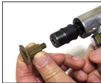
Attaching CSR to 1/4" collet interface